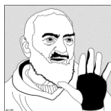
ST. PADRE PIO

Bereavement Meeting for September will take place on Wednesday, September 11 th from 1:30 to 3:30 pm. We meet in the Parish Ministries Office, which is located in the convent basement. Enter through the convent gate on 77 th Avenue and proceed to the back of the convent that is on street level and has a sign indicating Parish Ministries. Our phone number is 718-821-3285.